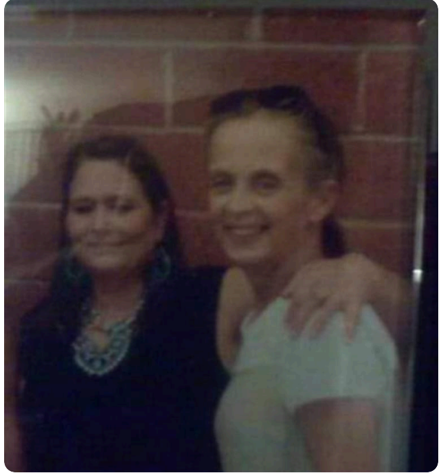
Will always love you sister. Love you to the moon and back. Always in my pocket by my heart...